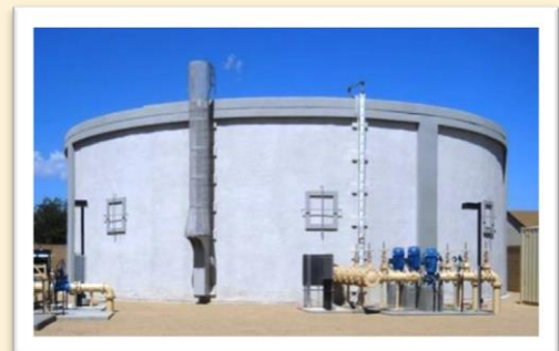
Brisas Well Site

The City of El Mirage conducts extensive monitoring to guard against contaminants in the drinking water according to federal and state laws. The state of Arizona requires monitoring for certain contaminants less than once per year because the concentrations of these contaminants are not expected to vary significantly from year to year, or the system is not considered vulnerable to this type of contamination. All detected contaminants were below the maximum contaminant level in the drinking water. There were no violations. This ensures that the quality of the drinking water for El Mirage is safe and poses no health risks.