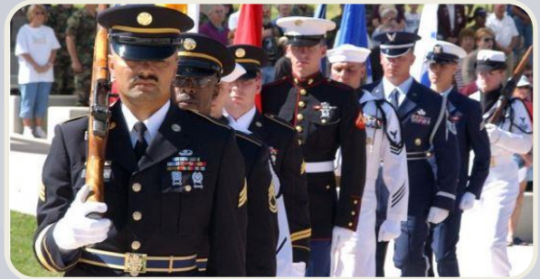
Veteran Programs & Projects

Engraved memorial brick pavers will surround the new monument at the new Veterans' Memorial Plaza. Each paver has up to three lines with no more than 15 characters per line.